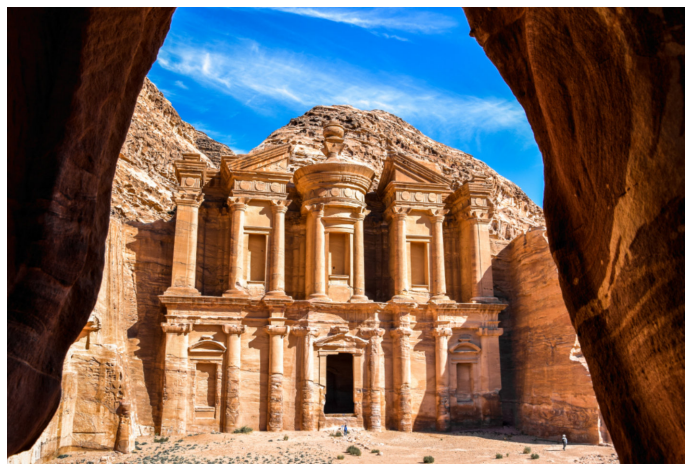
The program given is a rough guide only and may be subject to change without notice.