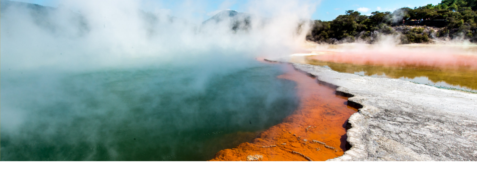
Today is tommorow, we have just crossed the international date line.

New Zealand welcomes us in Auckland , a cosmopolitan city, and mixture of Polynesian culture and the British regime. You will visit Rotorua, the heart of Maori country and a region of high geothermal activity, known for its geyser and sulfur springs.