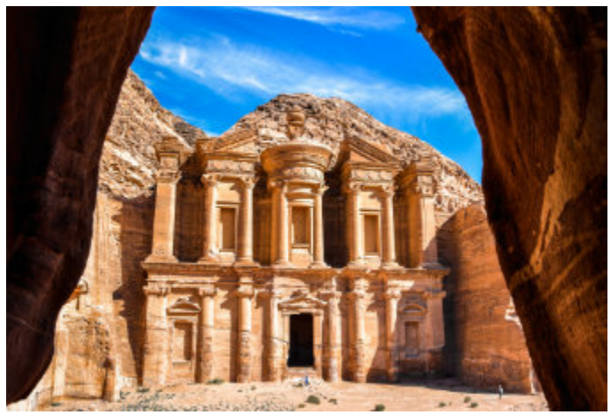
The program given is a rough guide only and may be subject to change without notice.